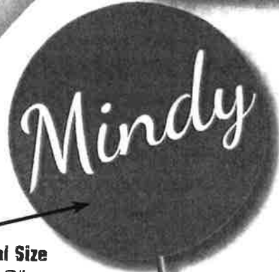
Actual Size 6" x 6"

Show your dance pride with a yard sign! Locally made, these signs are constructed of PVC gatorboard with printed vinyl applied to the surface. They are durable, weatherproof and a stake is provided for easy display. Add your name as an option! See reverse side for order form.