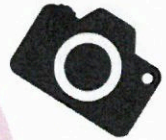
Photo and video allowed at dress rehearsal only! No flash photography please.

No food or drinks are allowed in the auditorium at any time.